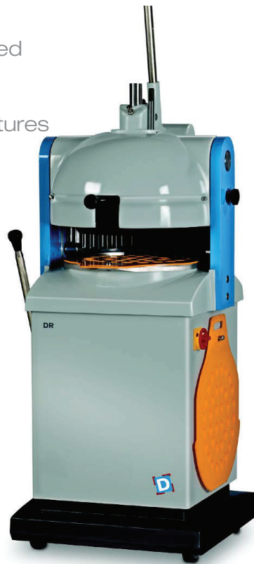
DR2 - 4/30