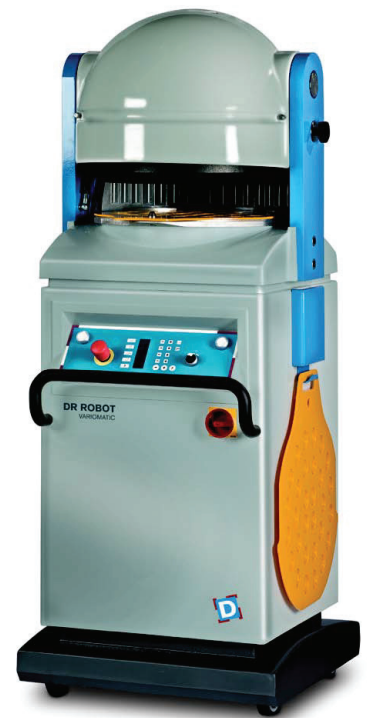
DR-Robot2 - 4/30A